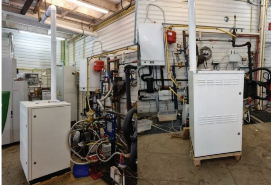
Figure 2. Tested mCHP SOFC in the laboratory facilities of the University of Liege [22].