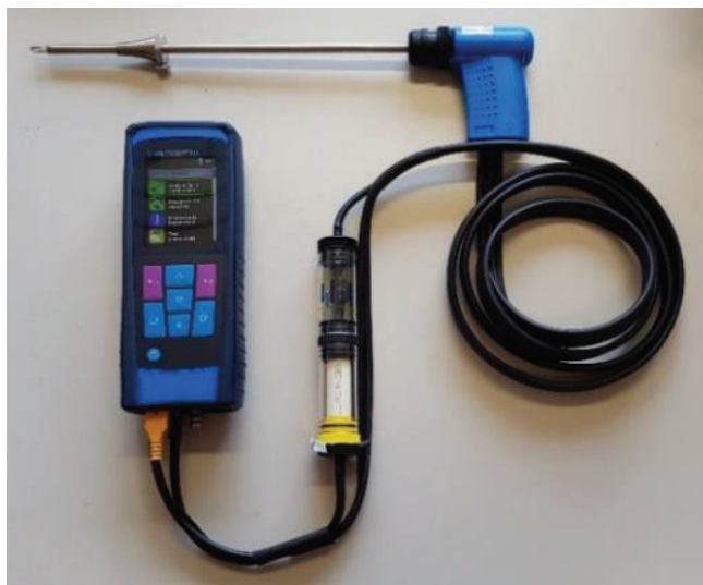
Figure 3. 'Multilyzer STx' combustion analyser portable meter.